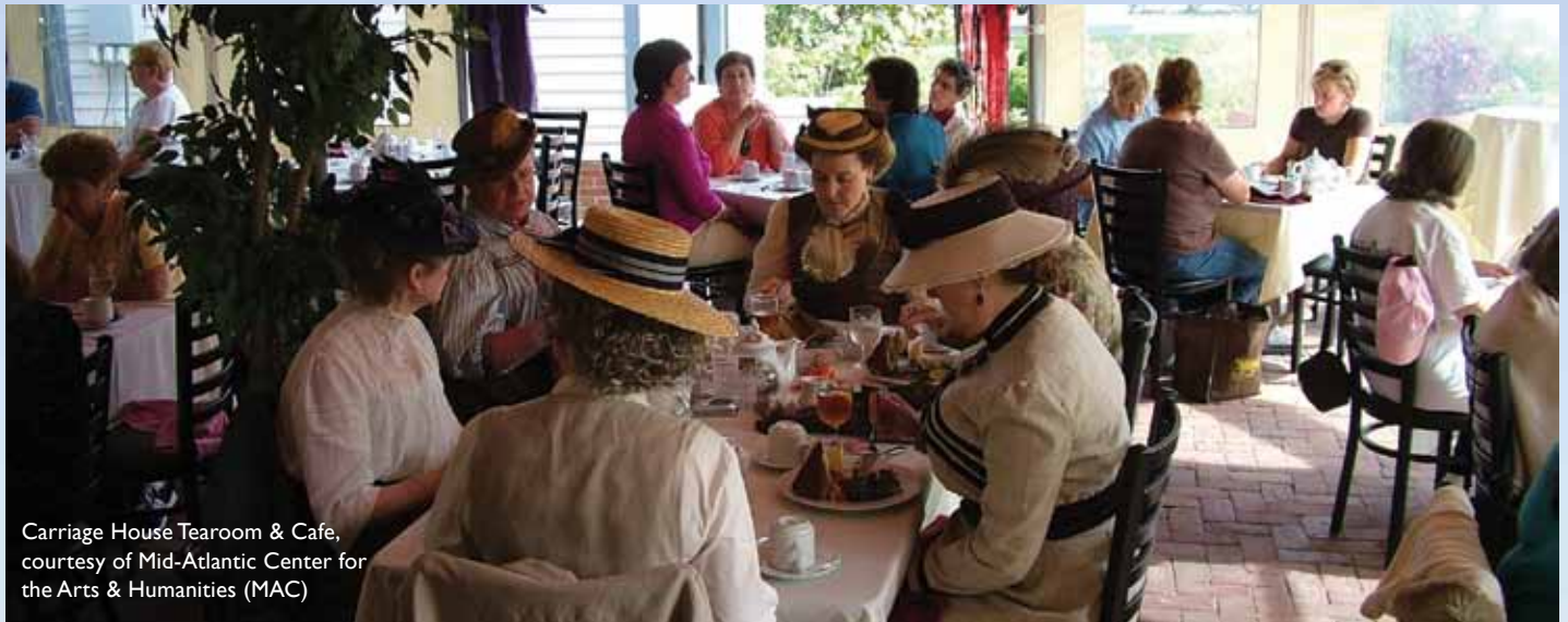
Carriage House Tearoom & Cafe

Perhaps the most prominent activity, on or off the beach, is enjoying life as a culinary tourist in Cape May, a destination dining location. The Washington Inn (801 Washington Street, 609-884-5697, washingtoninn.com ), in the heart of the Cape May Historic District, was originally built in 1840 as a plantation home. The Washington Inn's five unique dining rooms range from summer patio dining to fireside tables.