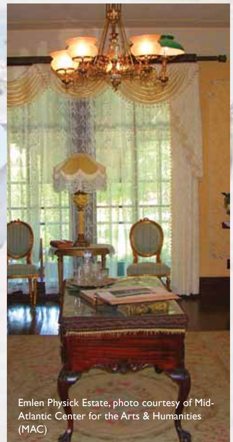
Emlen Physick Estate

A different kind of arts experience awaits visitors to Congress Hall's Sea Spa (205 Perry Street, 609-884-6543, www.congresshall.com), across from the oceanfront. The shellac manicure (also known as a uv gel manicure) and shellac pedicure promise (and deliver) nails that last over two weeks with narry a chip, even on those most hard on their mani-pedis. Facials have whimsical names such as "the long weekend," "the change of scenery," and the bi-partisan "running for Congress." One particularly nice feature of the treatments is that facialists customize and explain the treatments and then allow recipients to choose between the standard treatment and a customized version. Continued on Page 87